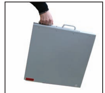
Easy to transfer data storage!

Record and store images and audio together for months or even years!